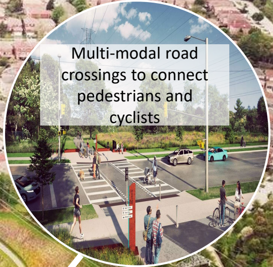
Multi-modal road crossings to connect pedestrians and cyclists