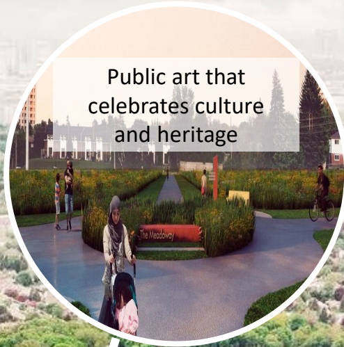
Public art that celebrates culture and heritage