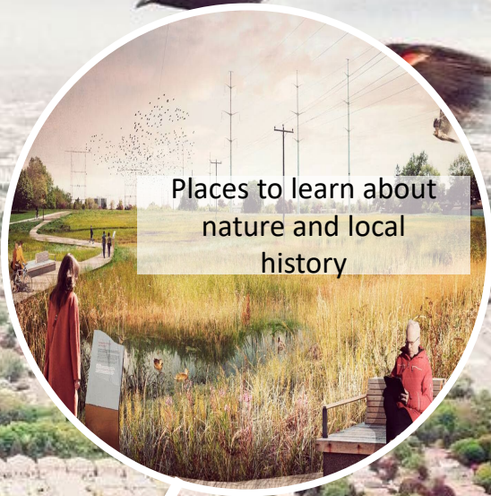
Places to learn about nature and local history