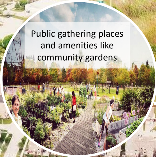
Public gathering places and amenities like community gardens