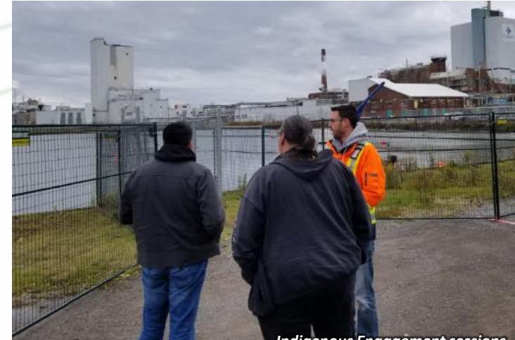
Indigenous Engagement sessions