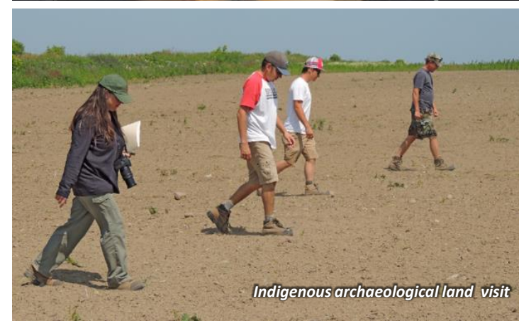
Indigenous archaeological land visit