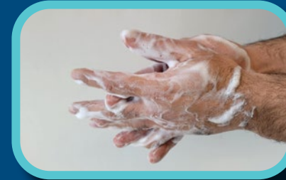
Step 3: Scrub backs of hands, between fingers, thumbs and around fingernails for at least 20 seconds