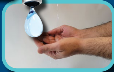
Step 1: Wet hands