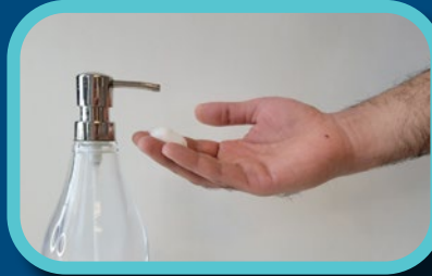
Step 2: Apply liquid soap